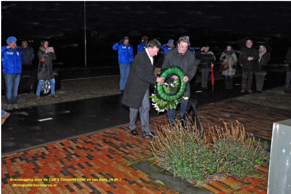
The King's Commissioners of Gelderland and Noord-Brabant laying a wreath at the Waalcrossing monument.