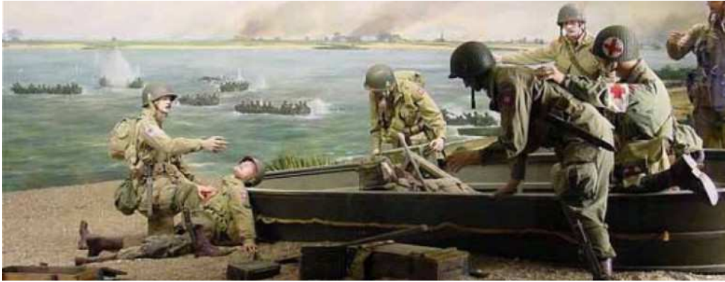
Panorama picture of the Waalcrossing

The Waal Crossing, as this action is known, cost 48 soldiers their lives. Atelier Veldwerk (Veldwerk Studios) created a light monument on the bridge, titled "Lights Crossing". This light monument on the new bridge is particularly striking. Along the bridge are 48 pairs of street lights, one for each soldier who lost his life. At twilight, the street lights are illuminated one pair at a time, at the pace of a slow march. It takes almost 12 minutes to illuminate all street lights. The first pair that is illuminated is located under the southern arch of the bridge, which resembles a reversed letter V.