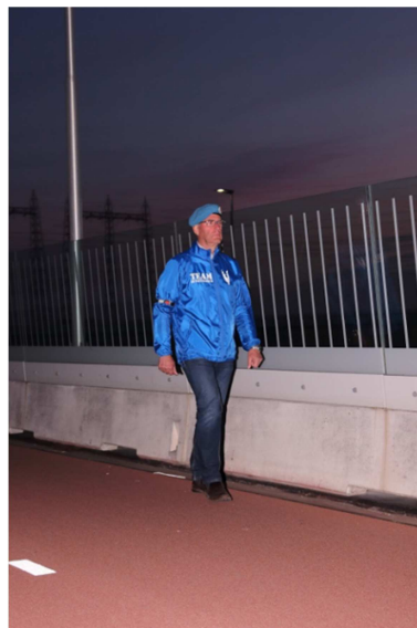
Veteran walking the Sunset March

Each night at sunset, a veteran walks the Sunset March over the bridge from south to north, walking at the pace at which the lights are illuminated, starting when the first pair is illuminated.