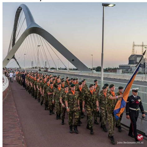
Contingent of Four Days' Marches participants

A unique cooperation exists between the Sunset March and the International Four Days' Marches Nijmegen. Both have a military background and a special bond with the city of Nijmegen, making cooperation a logical step. This year marked the centenary of the Four Days' Marches. In order to generate extra attention for both events, and to give national and international military personnel the opportunity to join the Sunset March, large international contingents of military personnel staying at Kamp Heumensoord walked the Sunset March on Monday and Tuesday (18 and 19 July 2016) of the Four Days' Marches week. On both days, the contingents were accompanied by a large number of interested visitors. On the two other days of the Four Days' Marches event, smaller contingents of military personnel walked the Sunset March. Representatives of the Veterans Institute and three Sunset March board members joined these Four Days' Marches to collect money for the event.