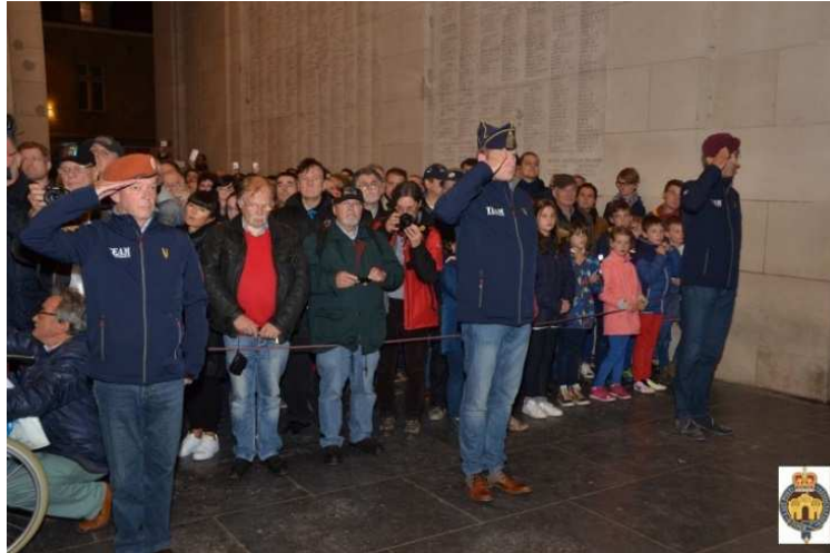
Sunset March board are the guards of honour during the Last Post ceremony.