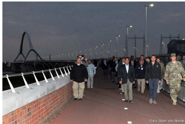
20 September 2016