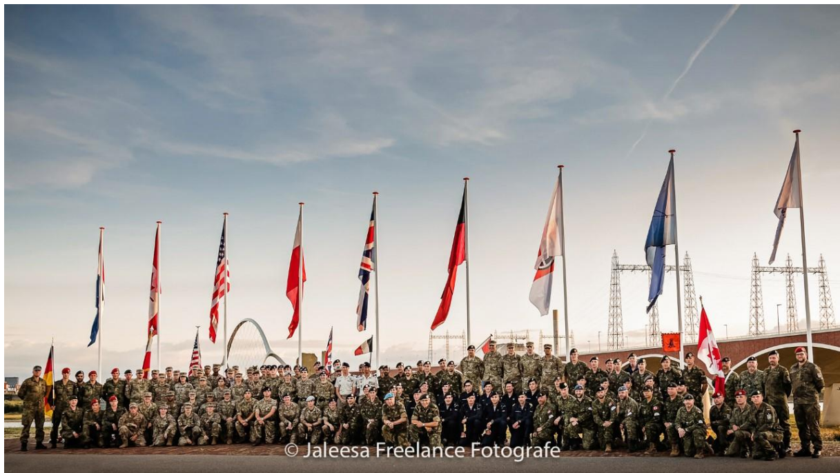
Photo of the Special Sunset March on 15 July 2019