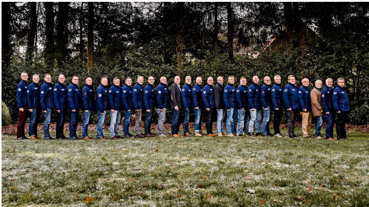
Group photo of participants of the Team31 meeting on 19 January 2019