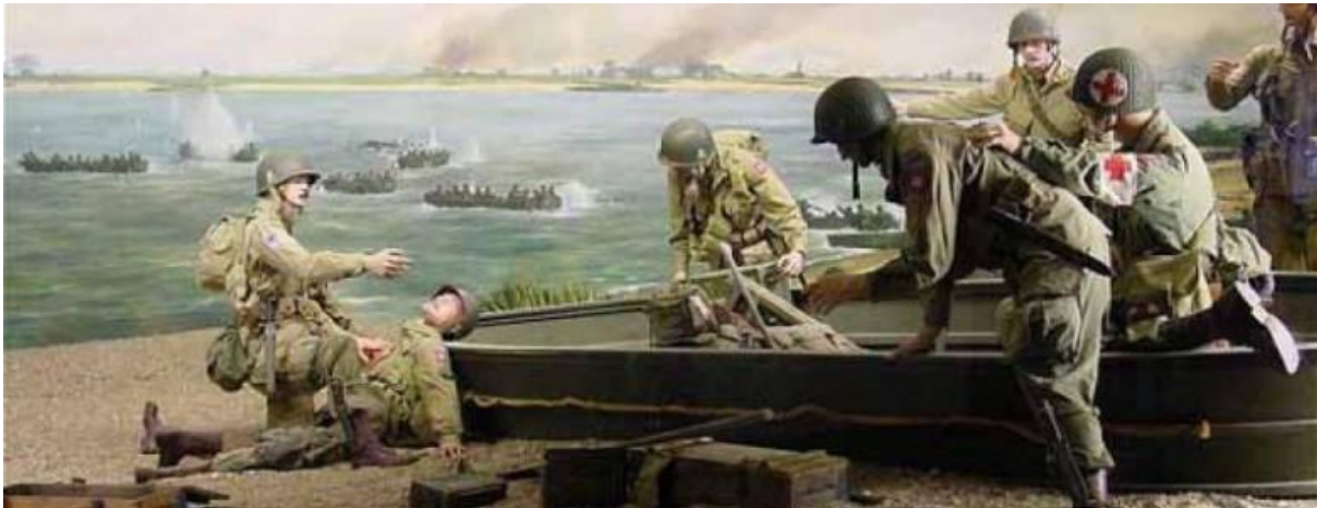
Overall view of the Waal Crossing

This operation is considered to be one of the most heroic actions of the Second World War. It owes part of its fame to the well-known war film "A Bridge Too Far". 2