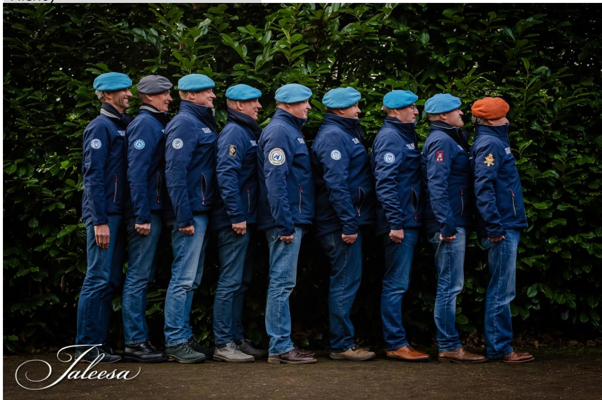
Sunset March Board also known as Sunset March Team.