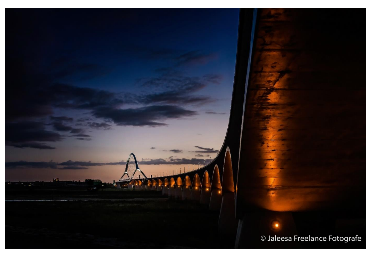
Photo 8: "De Oversteek" (The Crossing) after sunset