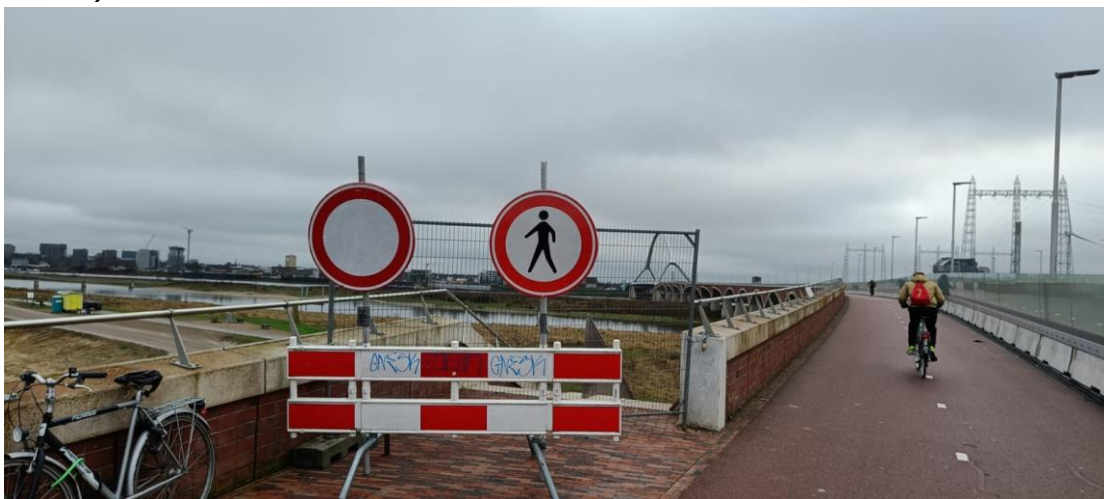
Photo 11: Stairs to the monument on the Oosterhoutsedijk will be closed till the end of 2022