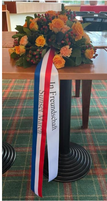
Photo 3: 4 May 2021: A wreath is placed at the Dutch Consulate in Cleves (D) in memory of the World War II War Victims.