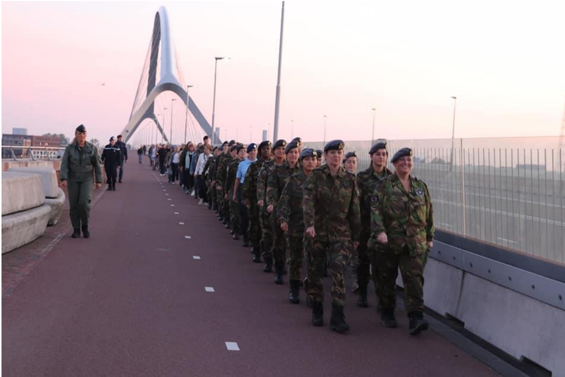
Photo 9: 22 September 2021. Women and Defence walks the Sunset March (Photography: source: Vrouw en Defensie [Women and Defence] Facebook page).