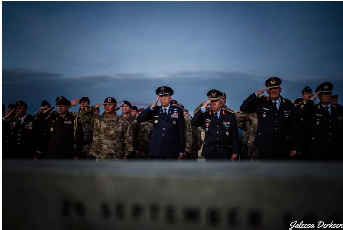
Photo 8: 20 September 2021: After the end of the March the Salute of Honour is made near the Waal Crossing Monument by among others a German and an American general.