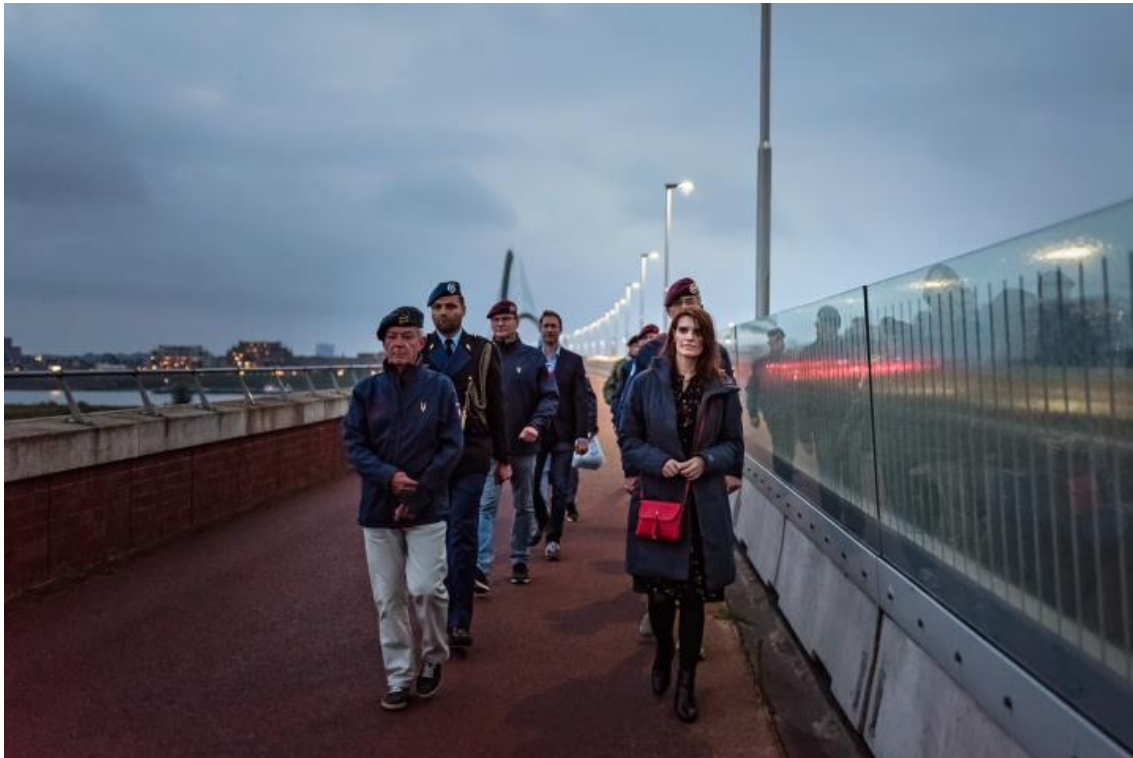
Photo 7: 22 August 2021: Caretaker Secretary of State for Defence, Mrs Barbara Visser (front right) walks the Sunset March as a honorary guest.