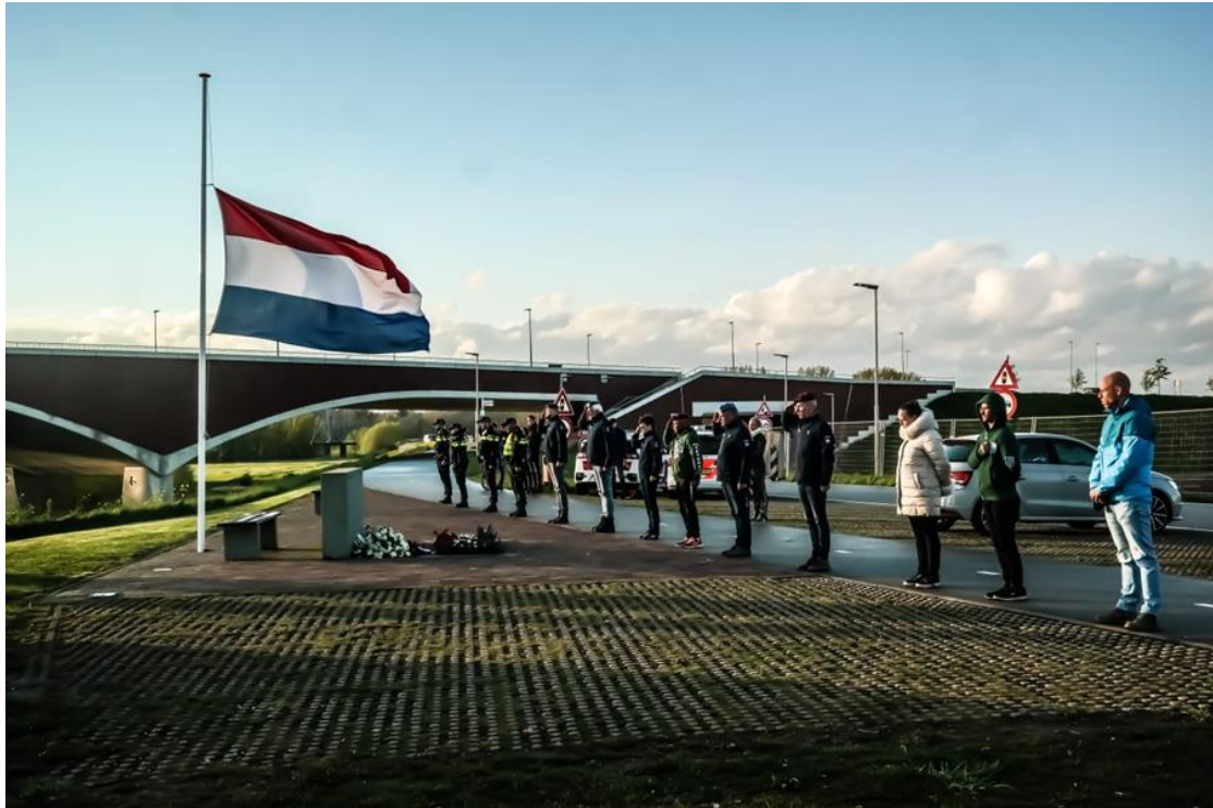
Photo 1: 4 May 2021: restricted commemoration ceremony at the Oosterhoutsedijk.