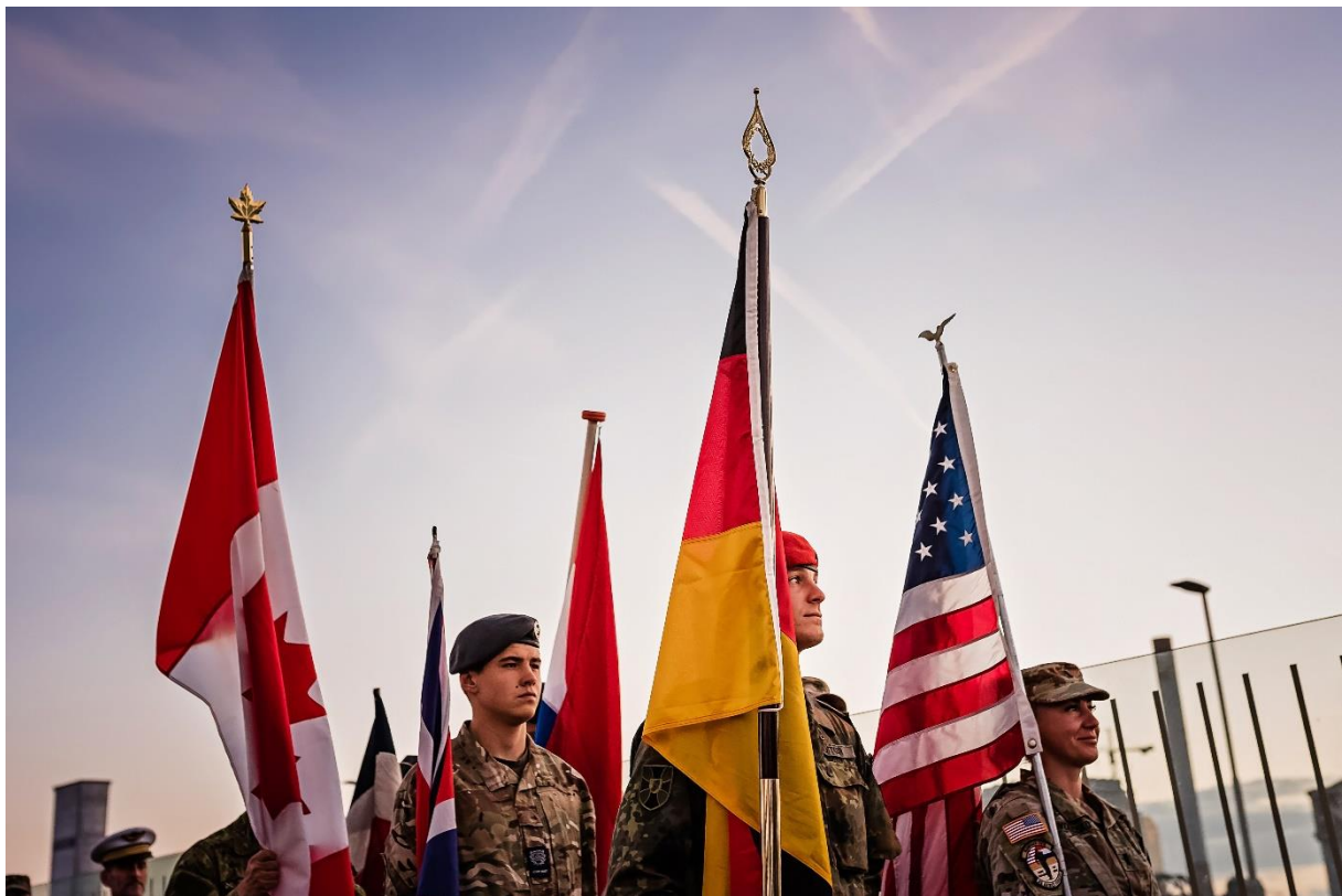
Figure 14: 4Day Detachment Heumensoord