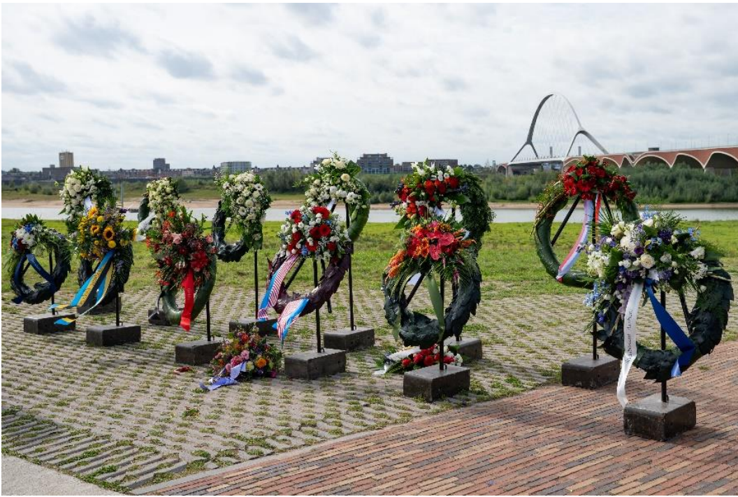
Figure 8: Wreath laying at the commemoration on 20 September.