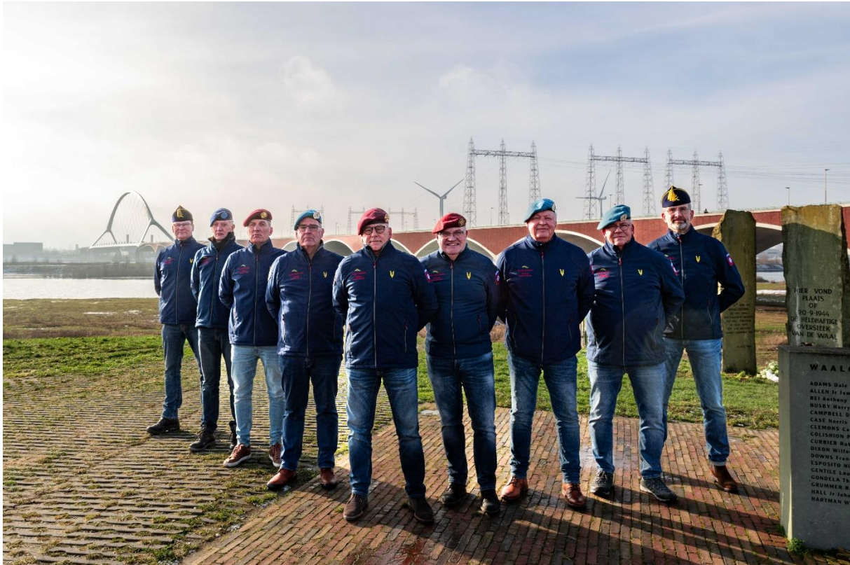
Figure 3: Board Sunset March

Team31 consists of 31 veterans, mostly but not exclusively from the Nijmegen area. They make sure that any gaps in the calendar are filled at all times and thus there is always a Veteran of Day. The existence of this fixed group of selected veteran runners thus guarantees the continuity of the daily ceremony. It is important to mention that the turnover among the members of the board and Team31 is very small. Most are members from the (almost) beginning and remain loyal thereafter. In 2022, 2 Team31 members left us and were replaced last year. At the end of 2023 another team member announced his retirement and will also be replaced soon by a candidate from the reserve list.