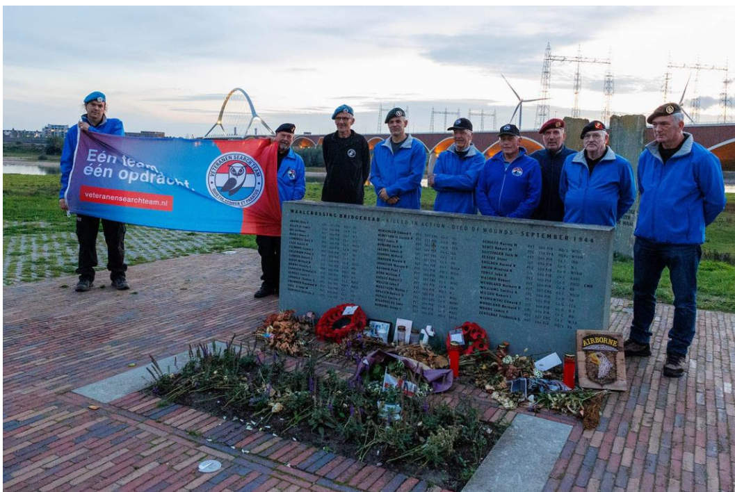
Figure 9: Veterans Search Team