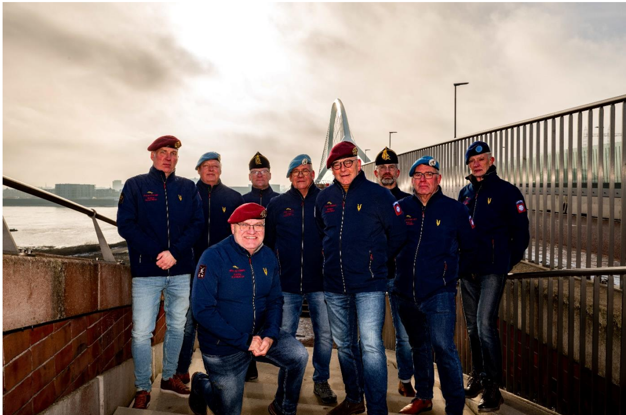
Figure 1: Board Sunset March