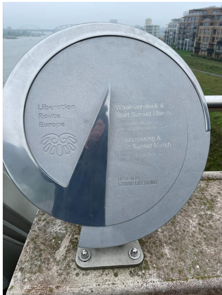
Figure 11: LRE vector placed at starting point Sunset March