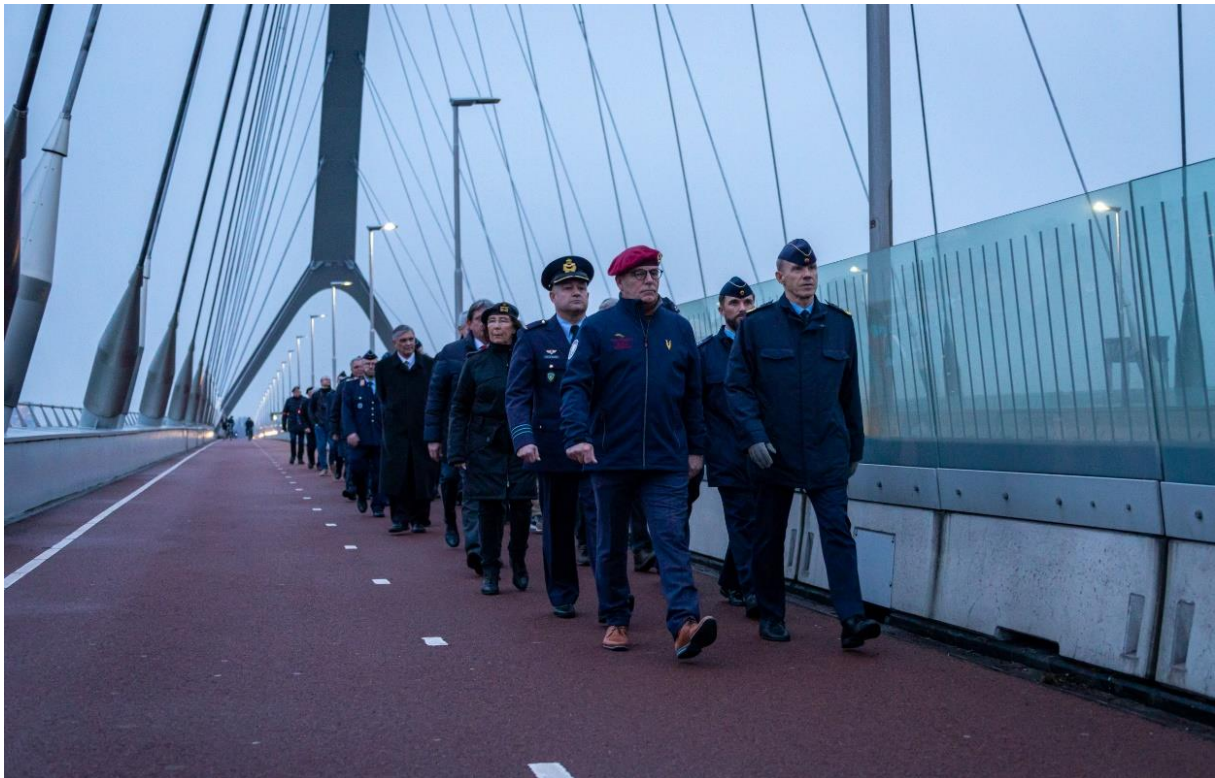
Figure 4: German delegation GE/NL Businessclub Kleve (D) and military personnel from Kalkar (D) led by LtGen T. Poschwatta.