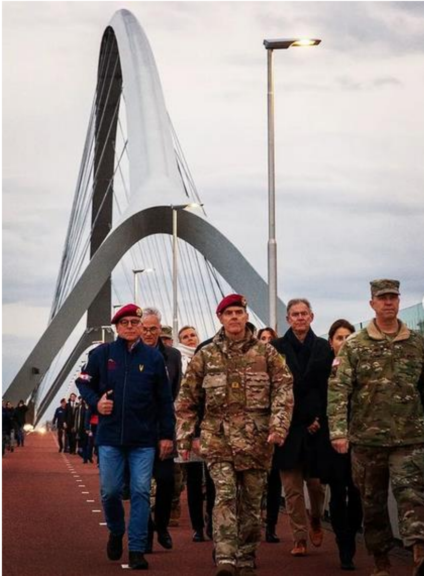
Figure 7: Brigadier General Cas Scheurs and Colonel Patrick Schuck; (photo 11LMB)