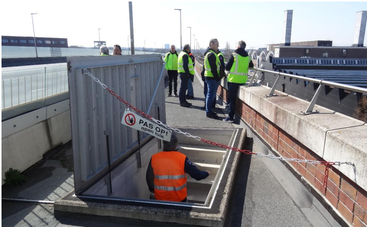
Figure 10: Visit by board and Team31 to the computer room and interior of the Crossing