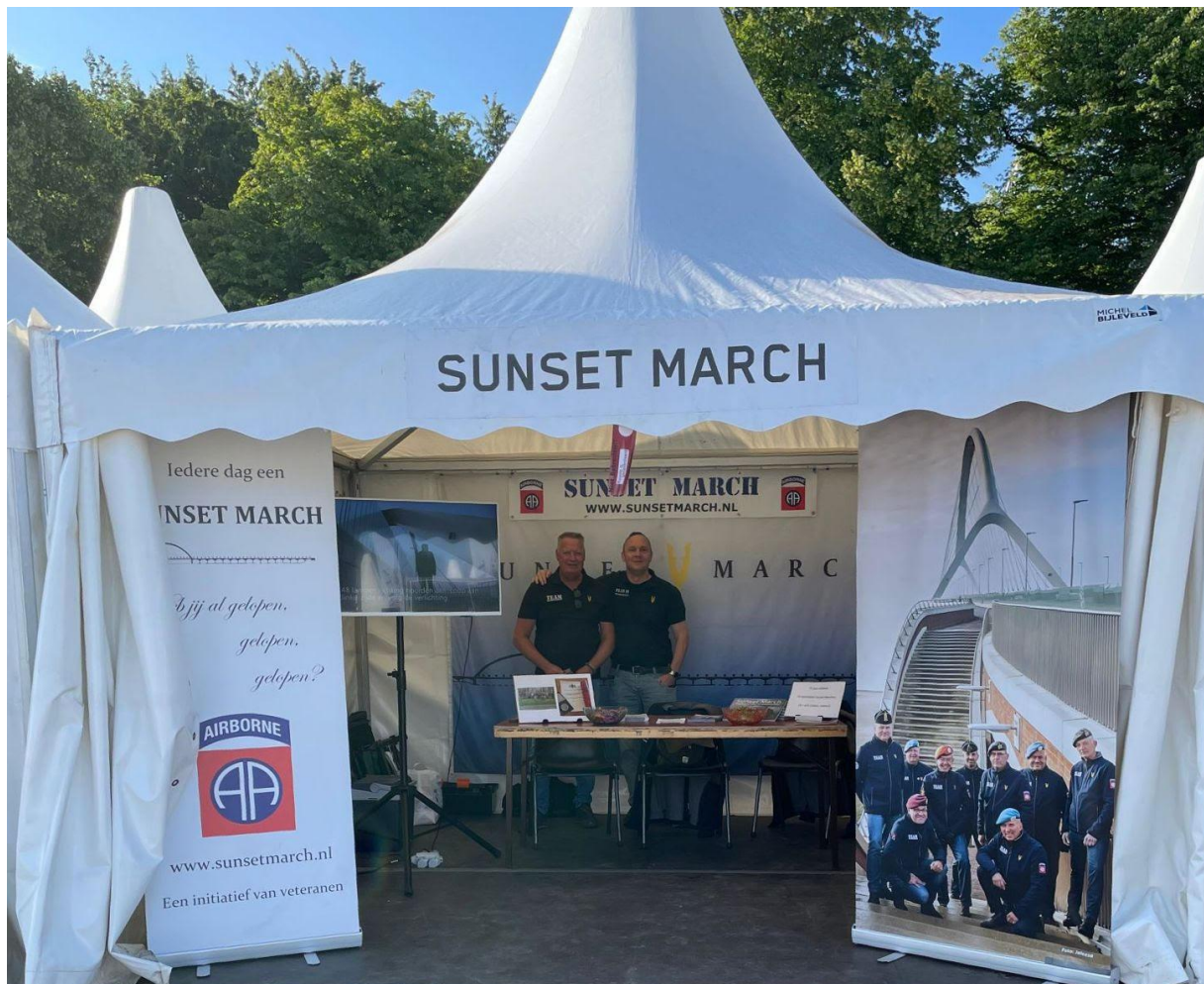
Figure 12: Booth on National Veterans Day